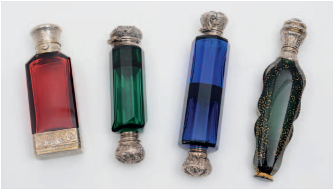
37, 38, 39, 40

35 A William IV silver sherry label, maker's mark illegible, Birmingham, 1836. with pierced vine leaf decoration, 6.5cm. wide, 0.69ozs.